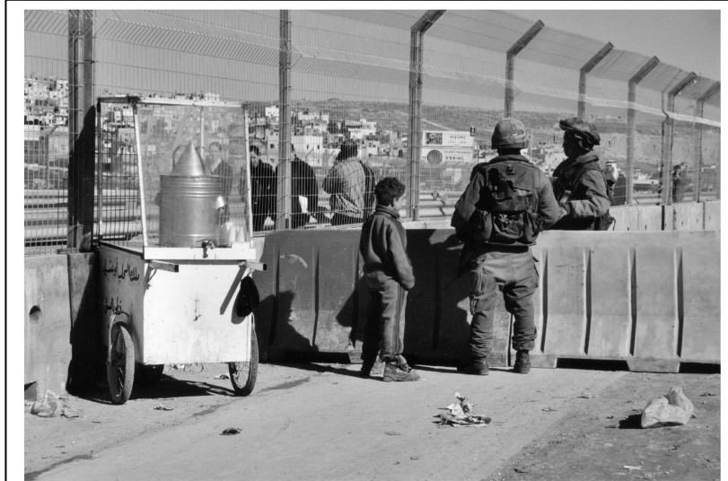
Palestinian boy with soldier at Qalandia checkpoint, 2002.

Trips of a few kilometres, where they are possible, take hours, following lengthy detours to avoid the areas surrounding Israeli settlements and settlers' roads (known as "bypass roads"), which connect the settlements to each other and to Israel and which are prohibited to Palestinians. With the spread of settlements and bypass roads throughout the