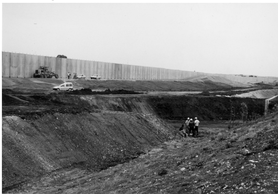
Wall near Qalqilya, October 2002.

On 14 June 2002, the Israeli government announced that work would begin immediately on the construction of a wall/fence (usually referred to as the “separation barrier”) along the perimeter of the West Bank, and north and south of Jerusalem (known as “the Jerusalem envelope”). The stated aim of the project is to prevent Palestinians crossing clandestinely from the West Bank into Israel, so as to prevent suicide bombings and other attacks. However, the barrier is not being constructed on the Green Line separating Israel from the West Bank. Most of it is being constructed on Palestinian land inside the West Bank - in some areas up to six or seven kilometres east of Green Line - in order to include some 10 Israeli settlements which are nearest to the Green Line. Construction of the first phase of the barrier (some 150 kilometres), in the northern West Bank governorates of Jenin, Tulkarem and Qalqilya and around parts of Jerusalem began in the summer of 2002 and was due for completion by July 2003, but is still ongoing. The course of the barrier has been altered even further eastwards in some locations so as to include more Israeli settlements.