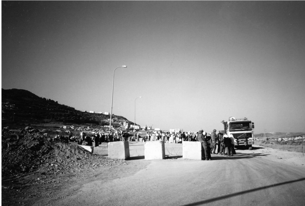
Palestinians waiting at Huwara checkpoint at the entrance to Nablus, October 2002.