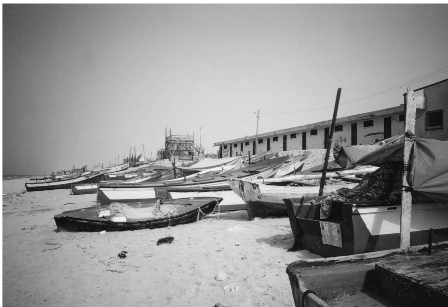
Fishing port, southern Gaza - boats are often prohibited by the IDF to go out to sea, October 2002.

The sea has been completely or partially closed to fishermen since the beginning of the intifada . For most of this period, there has been a ban on fishing off al-Mawasi Rafah and al-Mawasi Khan Younes in the southern Gaza Strip. From 12 May 2002 fishermen from Khan Younes and Rafah have been prohibited from fishing off the coast and from 1 July 2002 the same applied to fishermen from Deir al-Balah and Gaza. Fishing has been allowed up to 12 miles, normally limited to six miles, off the central and northern coast for most of this period. At some times, such as between 15 February and 16 March 2001, fishing was completely prohibited throughout the Gaza Strip.