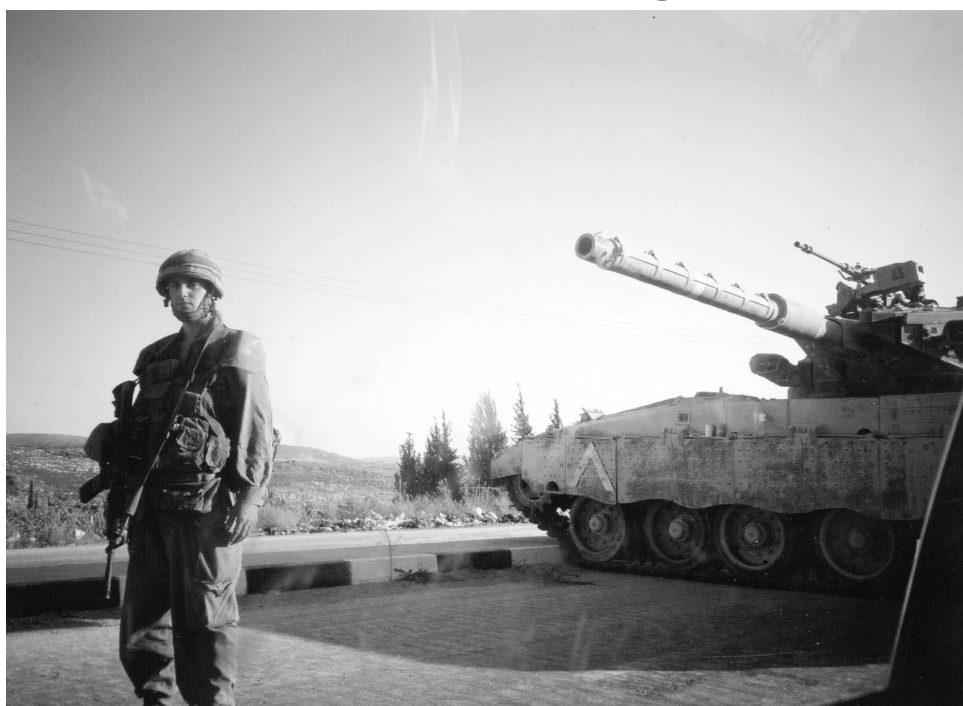
IDF blocking the road at Nablus, October 2002.

September 2003 AI Index: MDE 15/001/2003