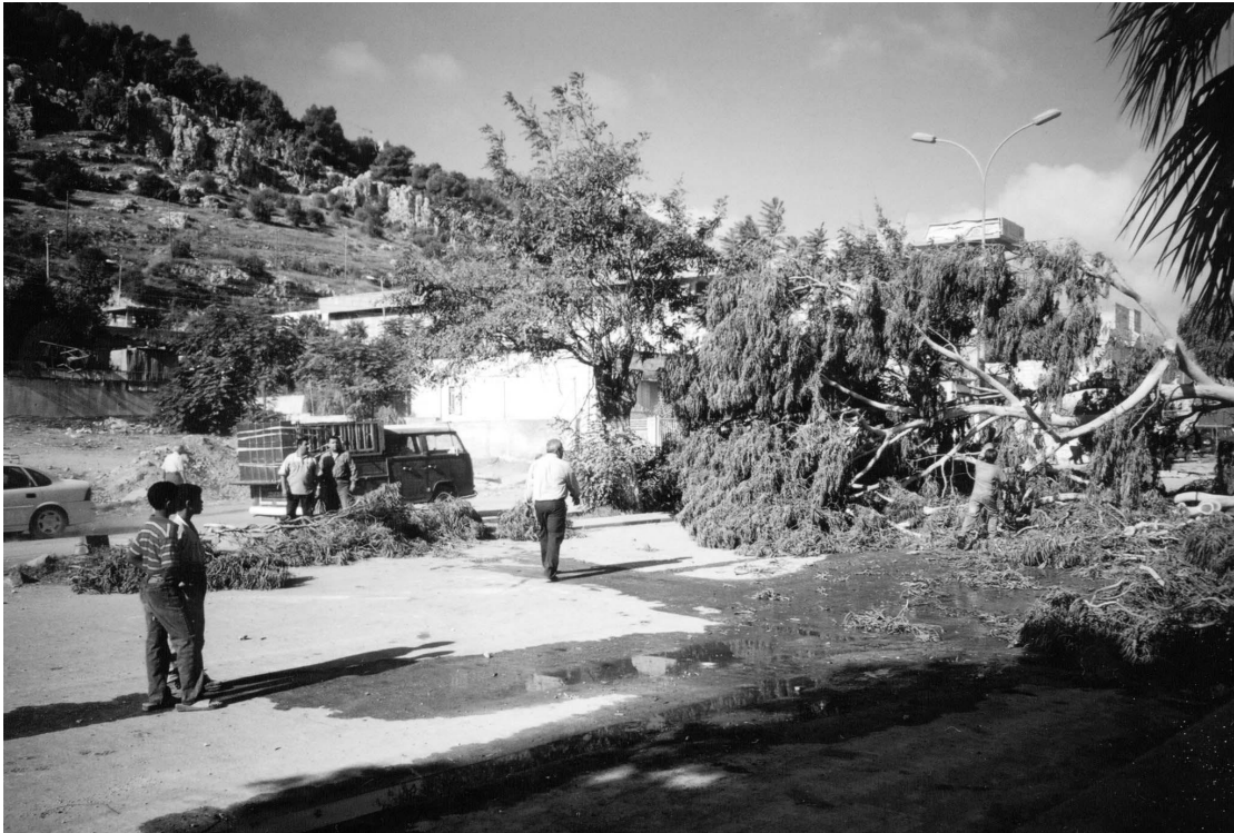
Trees cut down by the IDF to block the road to Nablus, October 2002.

Nablus is the second largest town in the West Bank, with a population of about 120,000. It is the economic heart of the northern West Bank, serving surrounding villages as well as Salfit, Tubas, Tulkarem, Qalqilya and Jenin governorates. Nablus has a stronger industrial base than other Palestinian cities, with factories producing a wide variety of products, in particular foodstuffs and clothing. The city also had a large number of artisans undertaking such activities as stonework and carpentry.